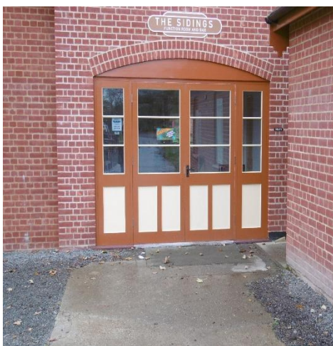
Function Room Entrance