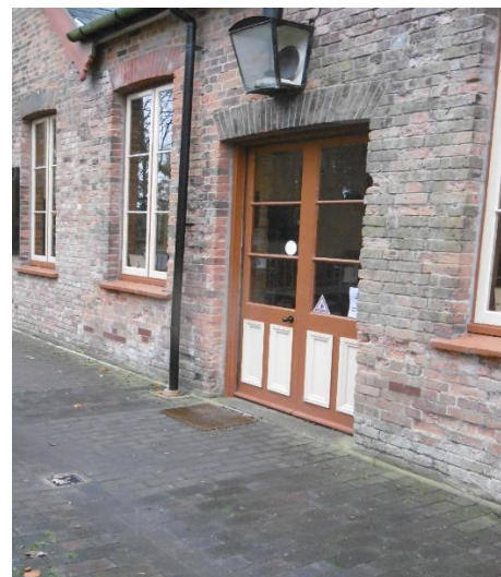
Station Entrance from Platform