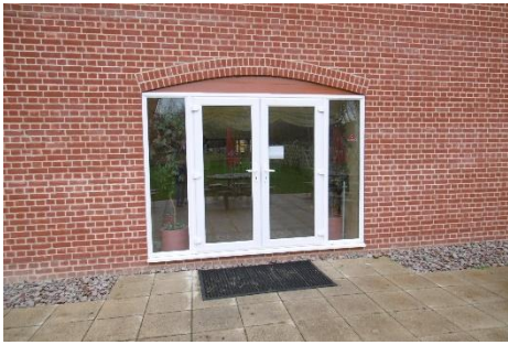
Entrance to Garden from Function Room