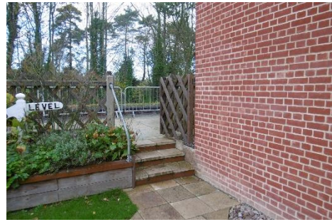
Entrance to Garden from Platform