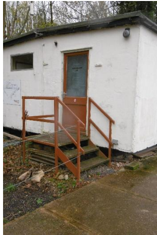
Model Railway Entrance