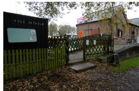
Marriotts Way Entrance